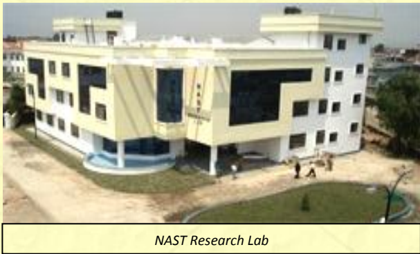
NAST Research Lab

THE HOST INSTITUTION: The Nepal Academy of Science and Technology (NAST) was founded in 1982. In its inception, it was established as an autonomous academic body, which was given additional autonomy by Parliament in 1992. It is an apex body in the country aimed to improve and promote indigenous technologies, research in science & technology and to identify and facilitate appropriate technology transfer. The main objectives of NAST are: