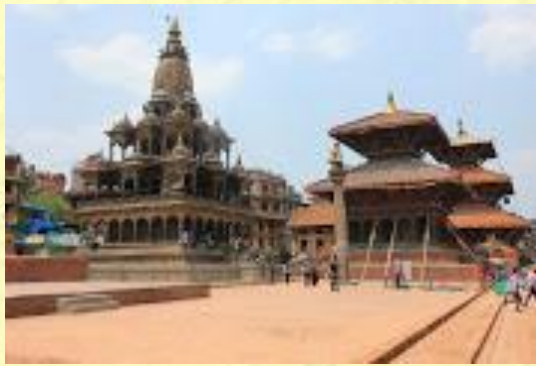
Patan Durbar Square

YOUNG SCIENTIST AWARD (YSA): Contributors with age below 35 years as on November 15, 2018 may submit their single authored (may be with supervisor) full length original research paper, not a published work, latest by September 30, 2018 for participation under Young Scientist Award Category presentation. Only one paper can be submitted against one registration. Participants under this category have to produce their age certificate at the time of presentation. The age certificate may also be sent along with full research paper through conference E-mail.